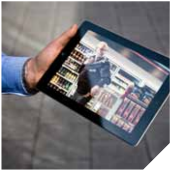
Image quality is clearly one of the most important features of any camera, if not the most important. Superior image quality enables the user to more closely follow details and changes in images, making way for better and faster decisions to more effectively safeguard people and property. It also ensures greater accuracy for automated analysis and alarm tools. Axis network cameras provide high-quality video images, and megapixel and HDTV network cameras are available to provide even more image details.